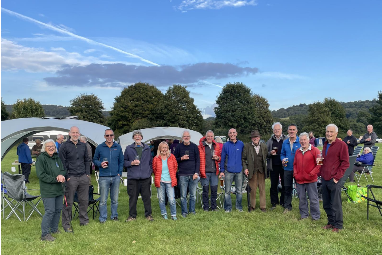
A posse of Presidents! (More came later but missed the photo call).