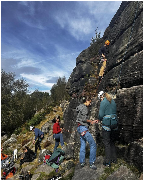
Left: Climbing teams at Birchens.

Link to video https://youtu.be/phRgIkStQzE?si=7-r5sRh3oMI9jk1N